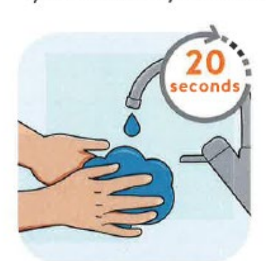
Wash your hands with soap and water for at least 20 seconds.