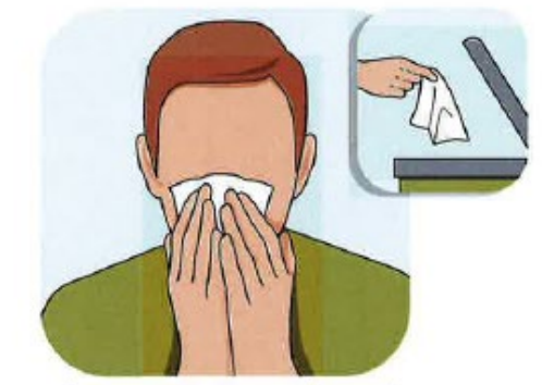
Cover your mouth and nose with a tissue and put your used tissue in a wastebasket.